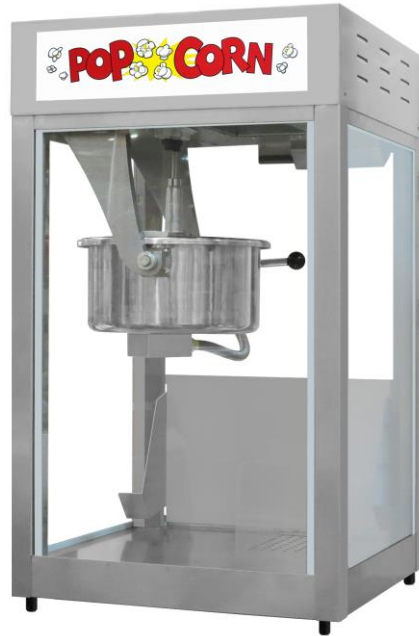
General image shown for reference.